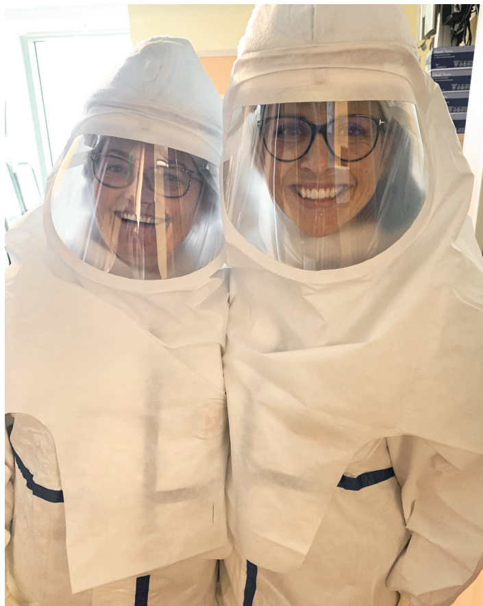
Two St. Elizabeth Community Hospital health care workers in powered air purifying respirator units.

Then last summer, the shift toward more long-term impacts began. We issued 159 grants totaling $1.6 million to small, locally owned businesses through the Aaron Rodgers Small-Business COVID-19 Fund at NVCF. For most of those businesses, it meant at least three months of rent to help them recover.