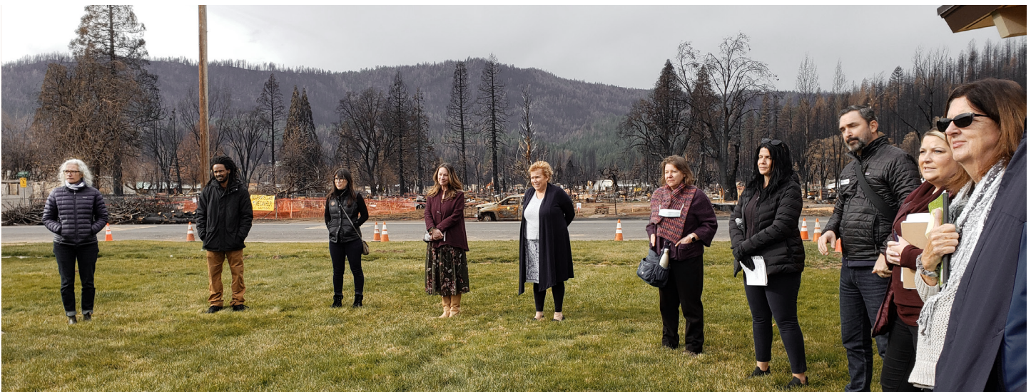
Members of the Dixie Fire Funders Roundtable gathered in Plumas County in October to tour the affected communities.