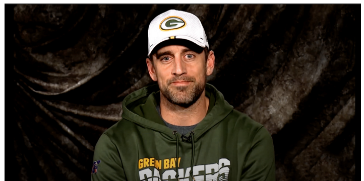
Aaron Rodgers makes a surprise appearance at the first anniversary of the Camp Fire and delivers a message of gratitude to NVCF.

We see every day in our work that so much more can be accomplished when we work together. We salute our many partners for embracing that concept as well.