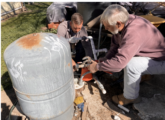
Contractors work to install water tank at a home near Orland.

The state grant caps the number of households in the water delivery program at 200 and the program is slated to end on Dec. 31. Glenn County Supervisor Grant Carmon said it will be critical to convince the state to extend the hauled water program into 2023 until permanent solutions are found. During the drought a decade ago, the state funded water deliveries for three years.