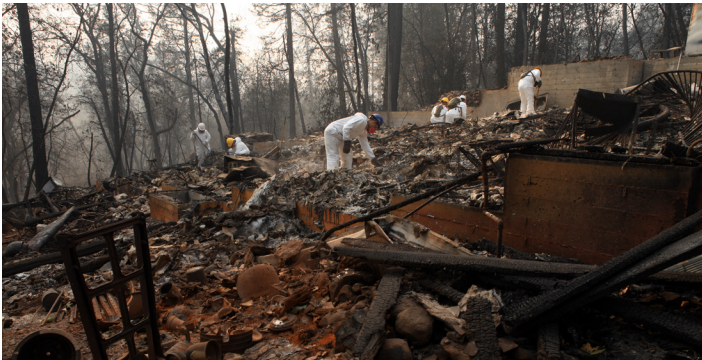
Volunteers sift through rubble of a home lost in the Camp Fire.

“Stronger together” is more than just a saying to us. In the community foundation world, it’s our lifeblood. We recognize we can accomplish almost nothing by ourselves. We would not exist without donors and partners.