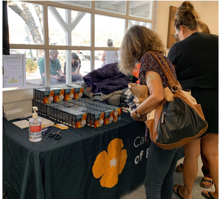
Fire survivors collecting supplies during the Bear/North Complex Fire anniversary event at the Wildfire Resource Center.

All told, NVCF has issued $1,167,940 in grants for Bear/North Complex Fire survivors.