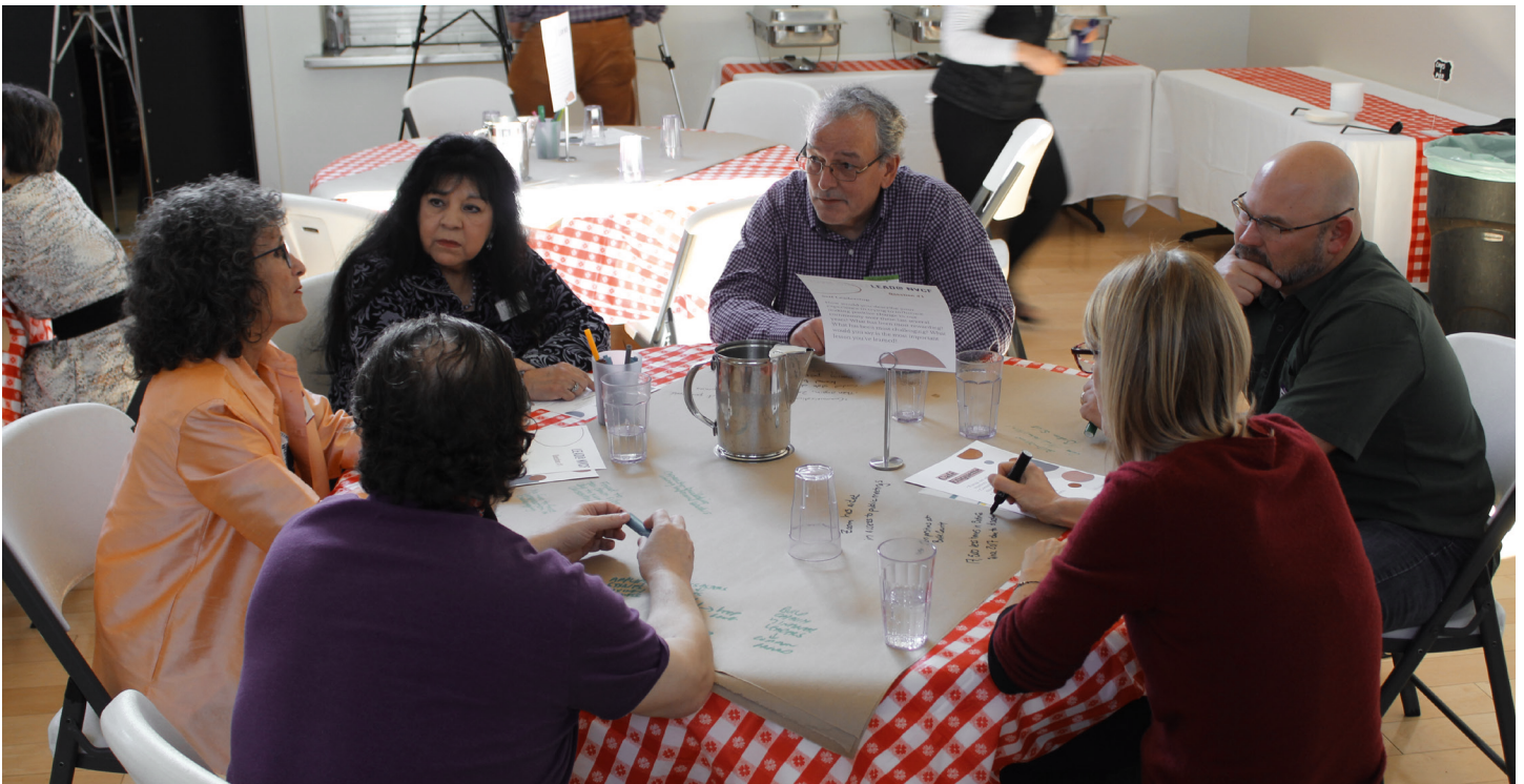
Group of community professionals participating in the Lead World Cafe.

Topics will include leadership, personal strengths, team building, collaboration, board and staff relations, governance, management and revenue generation.