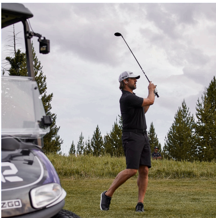
Aaron Rodgers teeing off at The Match, a charity golf tournament where he raised $200,000 for NVCF.

Businesses reported the timing and impact of the grants were both tremendous. Several businesses said they were wondering whether to cut jobs, hours of operation or even close entirely when the grant came. The grants from the small-business fund were a lifeline that let the business owners know they had high-profile support.