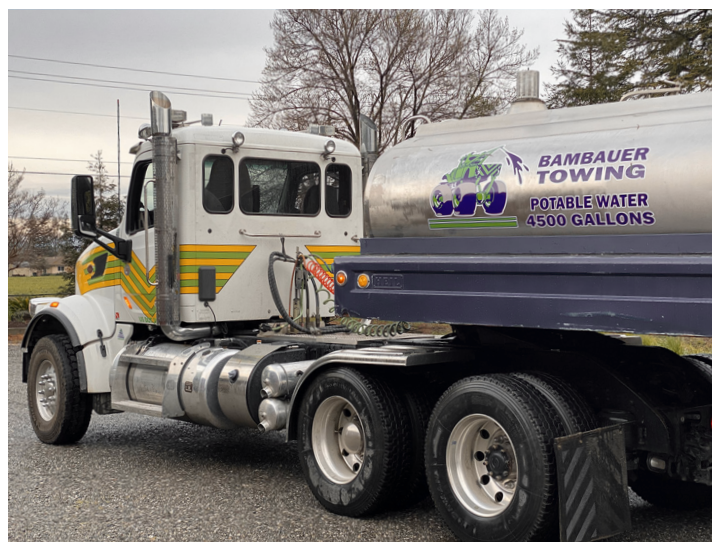
A water tanker delivers 1,250 gallons of nonpotable water to households in the program twice a month.