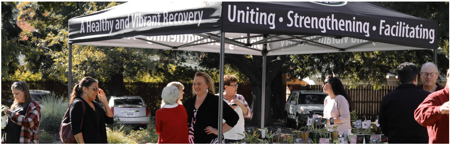
Disaster case managers gather at an appreciation event organized by the Camp Fire Collaborative.

NVCF and its Butte Strong Fund have been able to address both short-term and long-term needs for Camp Fire relief and recovery, thanks to an incredible number of donations received for that work.