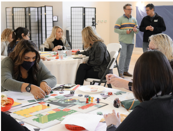
Butte County partners participate in a game of Fresh Biz, a team-building activity to practice creative problem-solving skills and how they can be used to address youth mental health.

Our CARE Team follows in the footsteps of the youth-driven “End the Silence” campaign, encouraging the community, particularly young people, to talk about