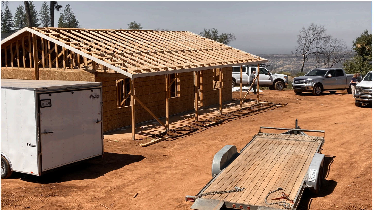
A home built in Paradise by Hope Crisis Response Network volunteers.